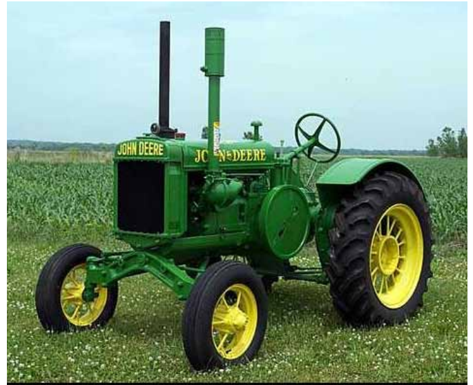
JOHN DEERE GP BEANER

339 cubic inch flat head engine (6 inch bore x 6 inch stroke); 15.5 Drawbar horsepower and 24.3 Belt horsepower; 3 speed transmission; and a mechanical lift operated by a foot pedal. The mechanical lift was a John Deere first and quickly became copied (and improved upon) by other tractor manufacturers.