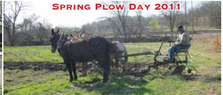
SPRING PLOW DAY 2011