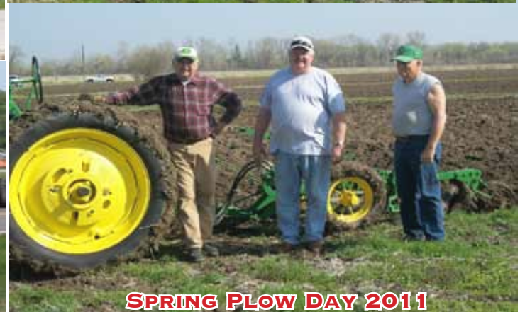
SPRING PLOW DAY 2011