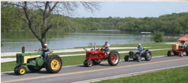
DREAM FACTORY TRACTOR CRUISE