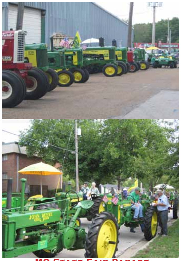
MO STATE FAIR PARADE