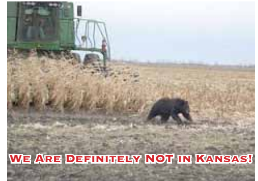
WE ARE DEFINITELY NOT IN KANSAS!