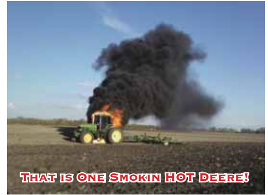
THAT IS ONE SMOKIN HOT DEERE!