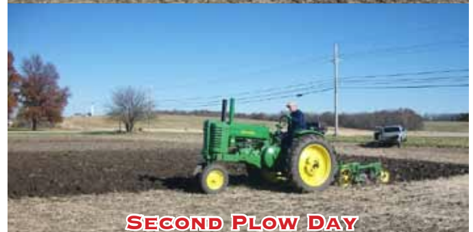
SECOND PLOW DAY