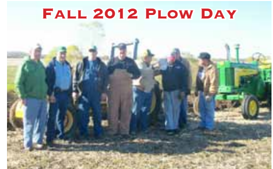
FALL 2012 PLOW DAY