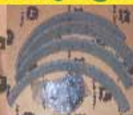
Brake Linings $30 to $75