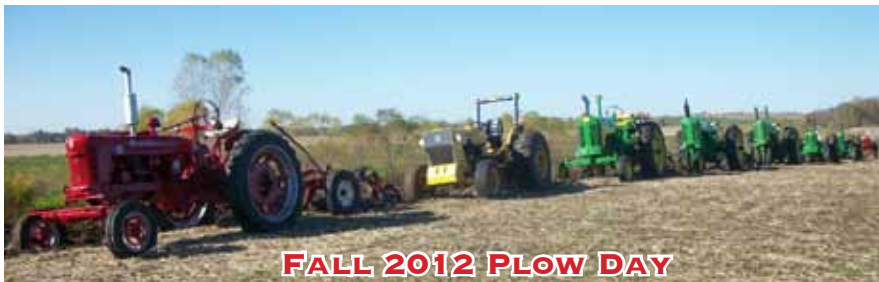
FALL 2012 PLOW DAY