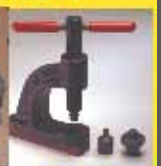
Rivet Tool $50