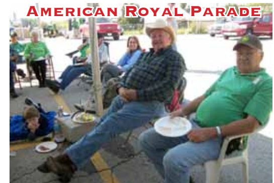
AMERICAN ROYAL PARADE