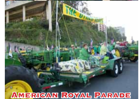
AMERICAN ROYAL PARADE