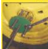
EZ Puller $150