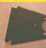
Top Link Holder 40, 420, 430 $50