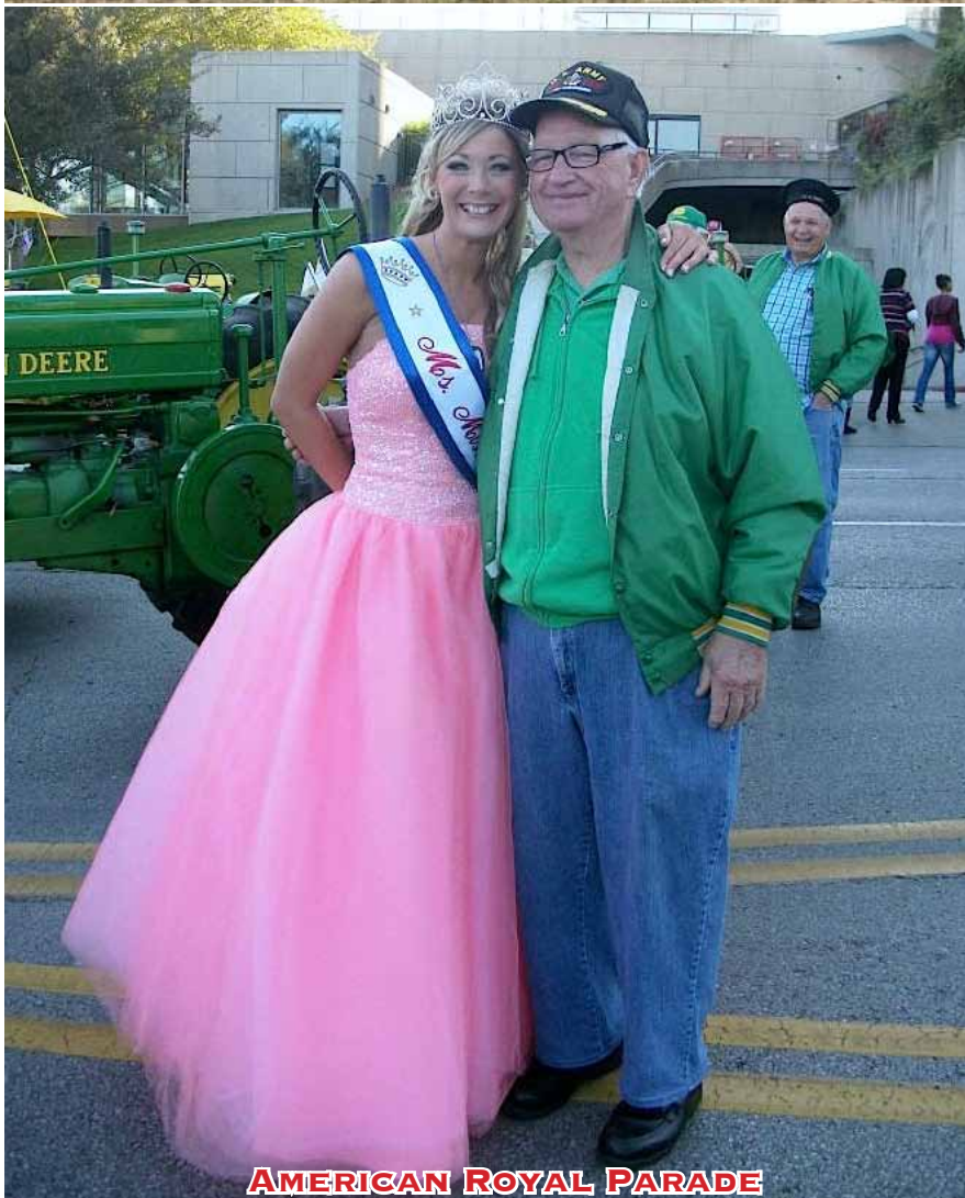
AMERICAN ROYAL PARADE