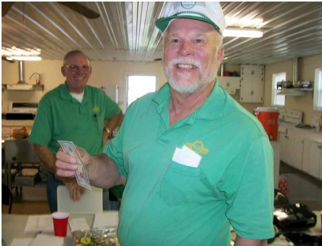
NOVEMBER MEETING, WHITE ELEPHANT AUCTION, AND RAFFLE DRAWING