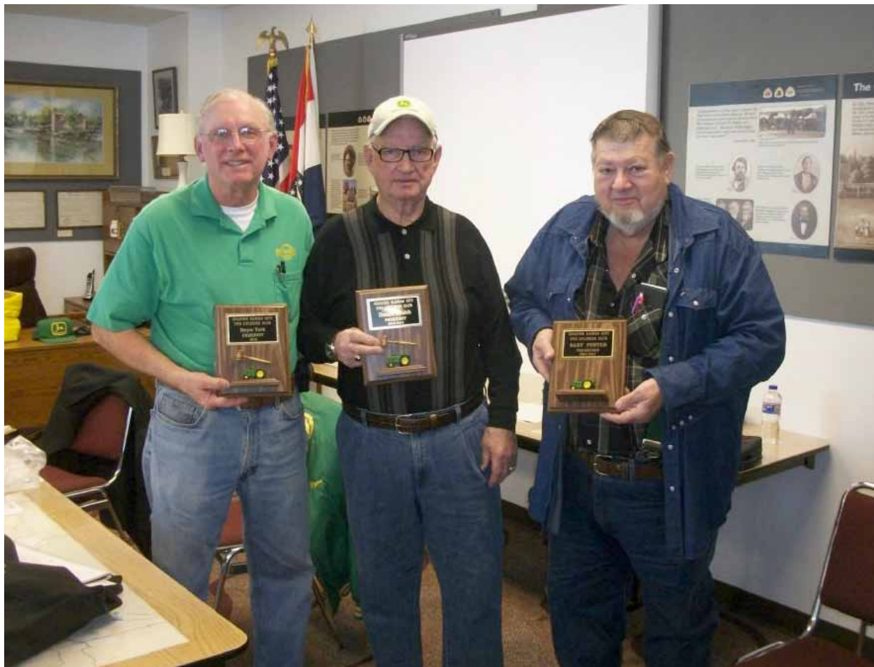
FEBRUARY MEETING - TRAILSIDE CENTER