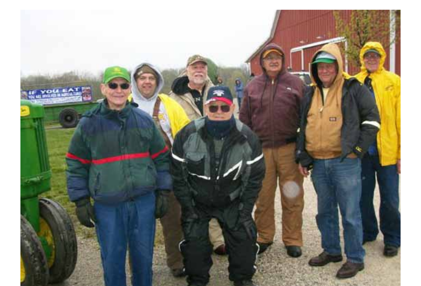
2013 AG HALL TRACTOR CRUISE