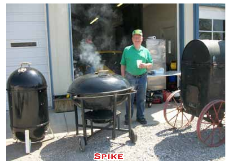
Page 4 of 10