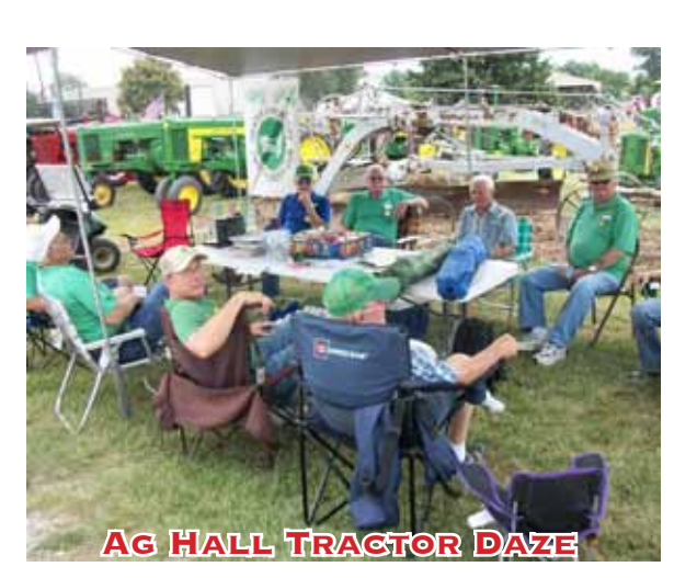
Page 4 of 10