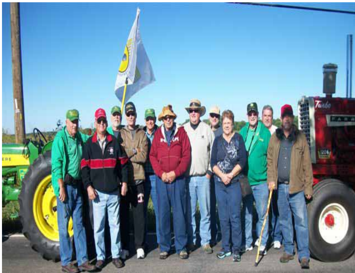
BUCKNER, MO - FESTIVAL IN THE VALLEY PARADE