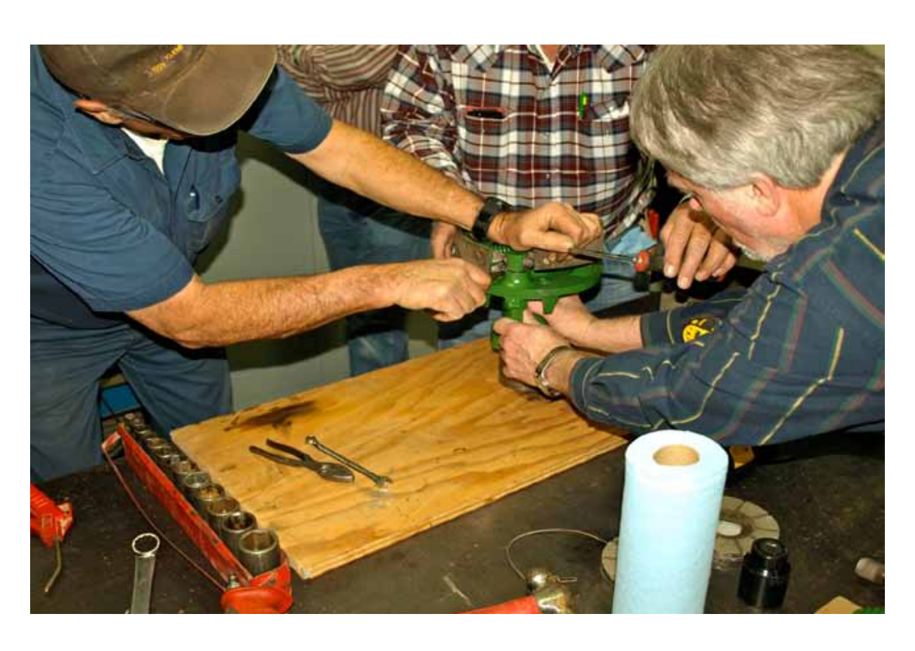
TECH MEETING - FEBRUARY 1, 2014