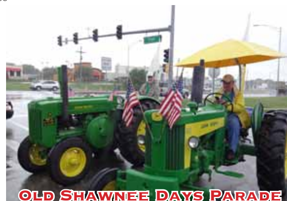
OLD SHAWNEE DAYS PARADE