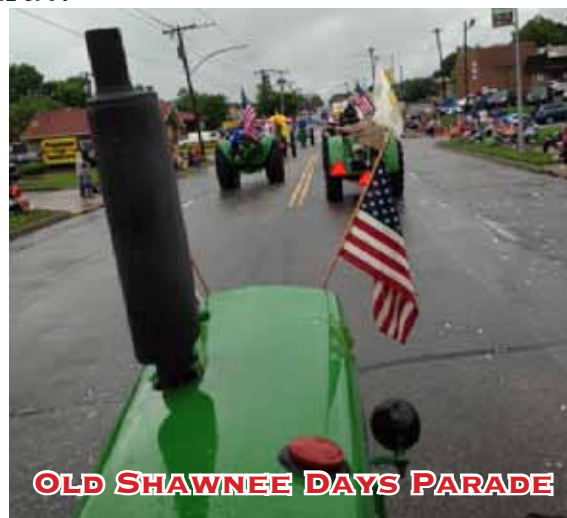
OLD SHAWNEE DAYS PARADE

Note: All dates are subject to change. Please check with a contact person to confirm date.