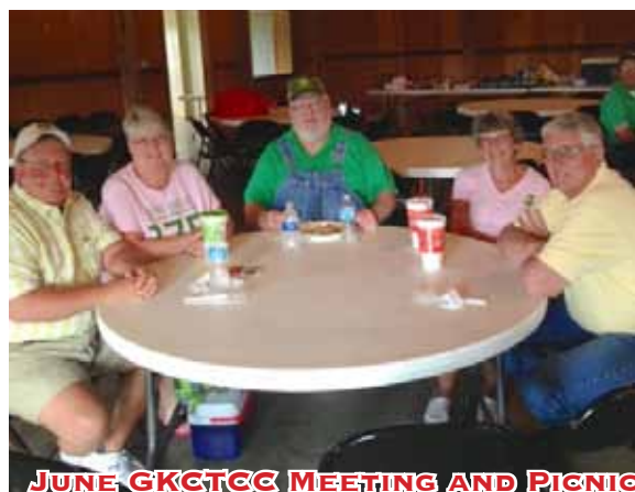
JUNE GKCTCC MEETING AND PICNIC