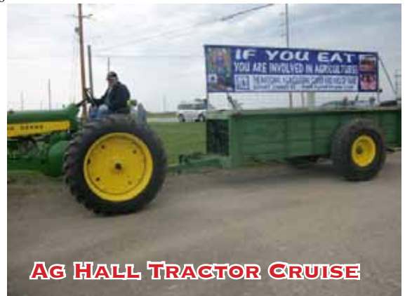
AG HALL TRACTOR CRUISE