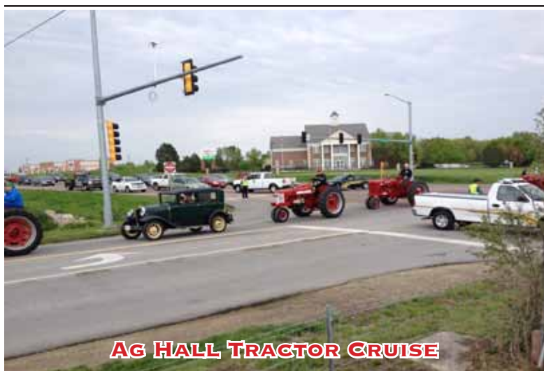
AG HALL TRACTOR CRUISE

John Deere Lawn, Garden, Toys, and Parts