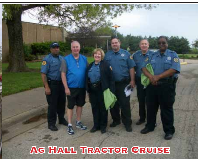
AG HALL TRACTOR CRUISE

John Deere Lawn, Garden, Toys, and Parts