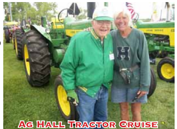
AG HALL TRACTOR CRUISE

Note: All dates are subject to change. Please check with a contact person to confirm date.