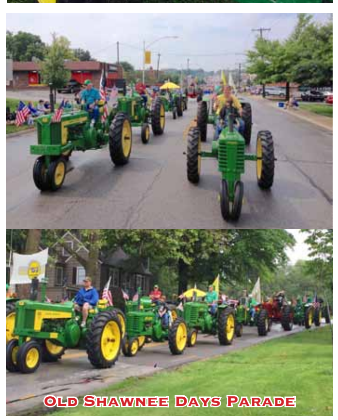
Page 4 of 8