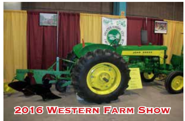
2016 WESTERN FARM SHOW