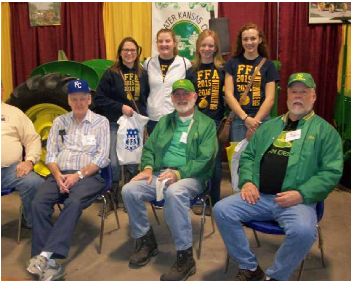
2016 WESTERN FARM SHOW, KANSAS CITY, MO