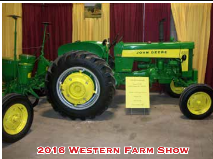
2016 WESTERN FARM SHOW

John Deere Lawn, Garden, Toys, and Parts