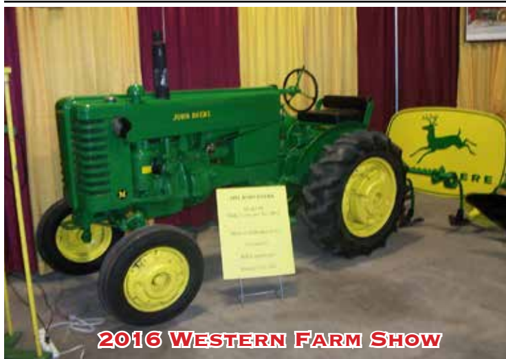
2016 WESTERN FARM SHOW

John Deere Lawn, Garden, Toys, and Parts