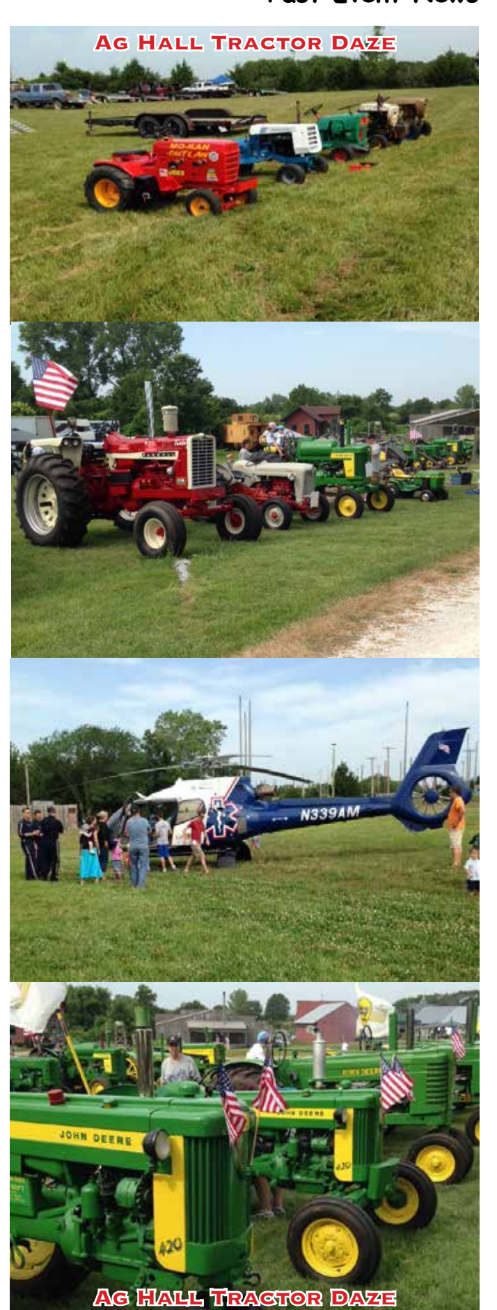
Page 4 of 8