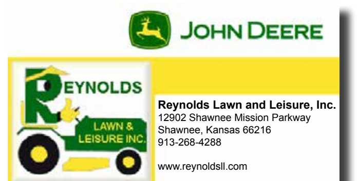
John Deere Lawn, Garden, Toys, and Parts