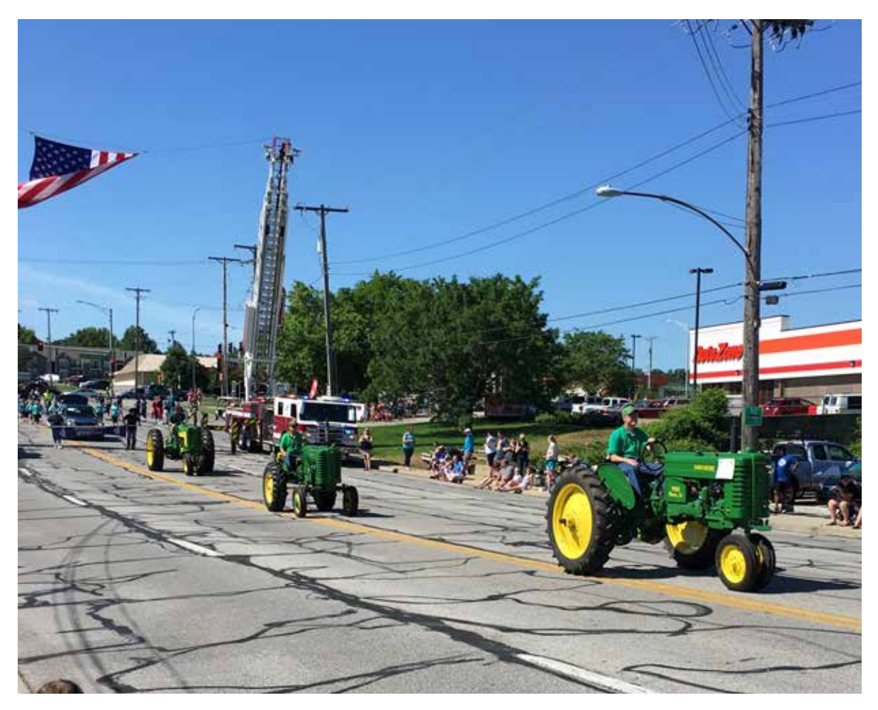
50TH OLD SHAWNEE DAYS PARADE