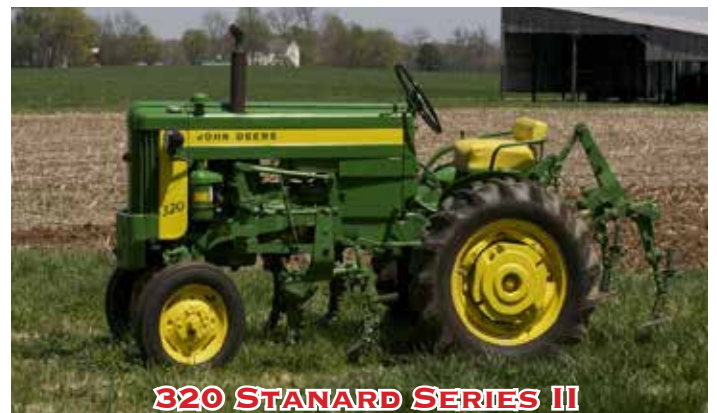
320 STANDARD SERIES II

John Deere Lawn, Garden, Toys, and Parts