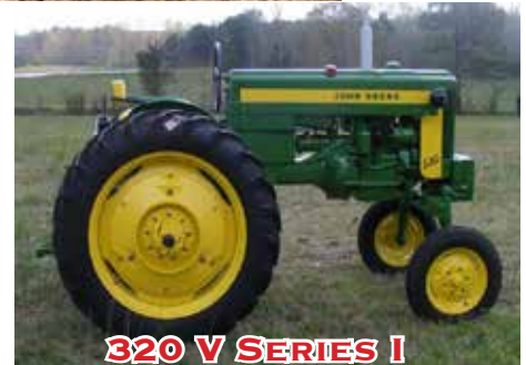
320 V SERIES I