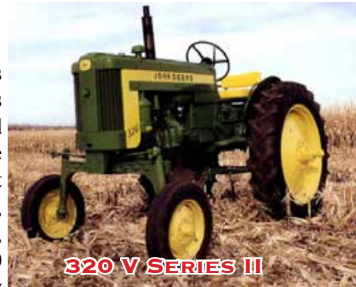
320 V SERIES II

The John Deere Model 320 tractor was designated Series I or II, by the year it was built (1957 or 1958). The Series I models had the steering wheel mounted straight up and down and tear drop lights. The Series II models had the steering wheel mounted at an angle for operator comfort and rounded sealed beam lights. Total Built: 3,084, Engine Displacement, 4.00" x 4.00" Engine: 100.5 ci, Horsepower: (Gas) 22.4 drawbar / 24.9 PTO, Speed: 1850 RPM, Cost New in 1958: $1900.00. The 320 was basically a continuation of the Model 40, built for the customer who didn't need the power and other features of the 420. The 320 was available in (S) Standard, (U) Utility, and (V) Vegetable (also known as Southern Special) versions. All offered the same rugged dependability established by the 40 at a rock-bottom price. Note: The John Deere Model 320's claimed horsepower was never tested at the Nebraska Tractor Test Laboratory.