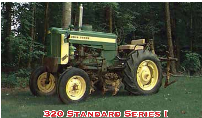
320 STANDARD SERIES I