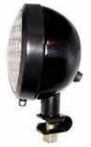
Rounded Sealed Beam