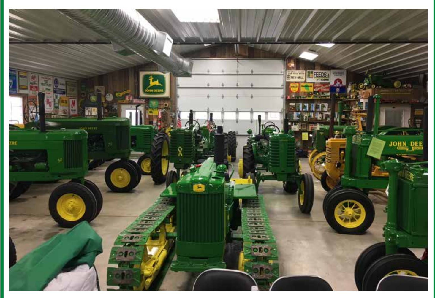
NOVEMBER 2016 MEETING AT G.A. SALMON'S FARM