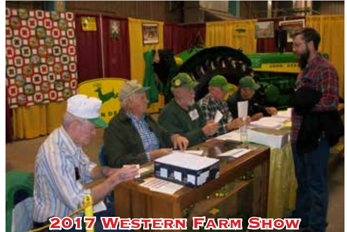
2017 WESTERN FARM SHOW