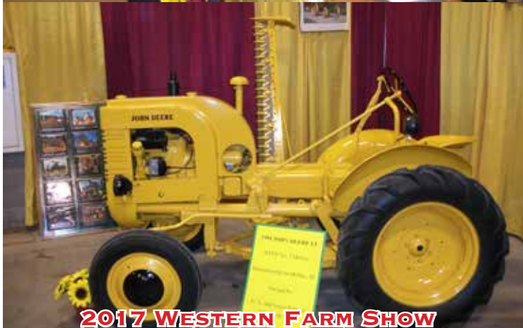
2017 WESTERN FARM SHOW