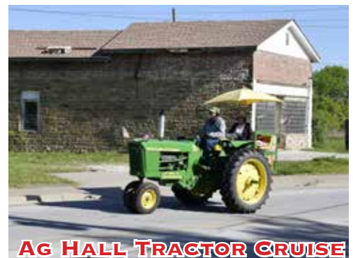
AG HALL TRACTOR CRUISE