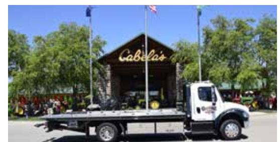
AG HALL TRACTOR CRUISE

Note: All dates are subject to change. Please check with a contact person to confirm date.