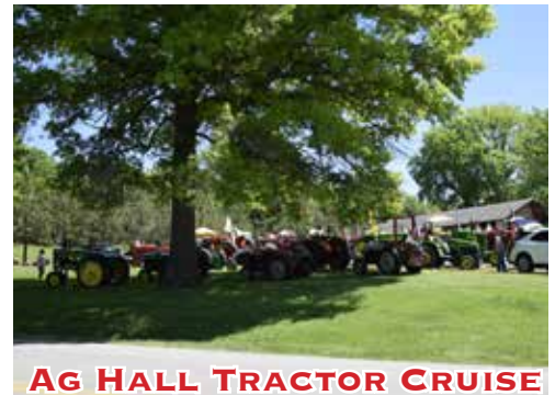
AG HALL TRACTOR CRUISE