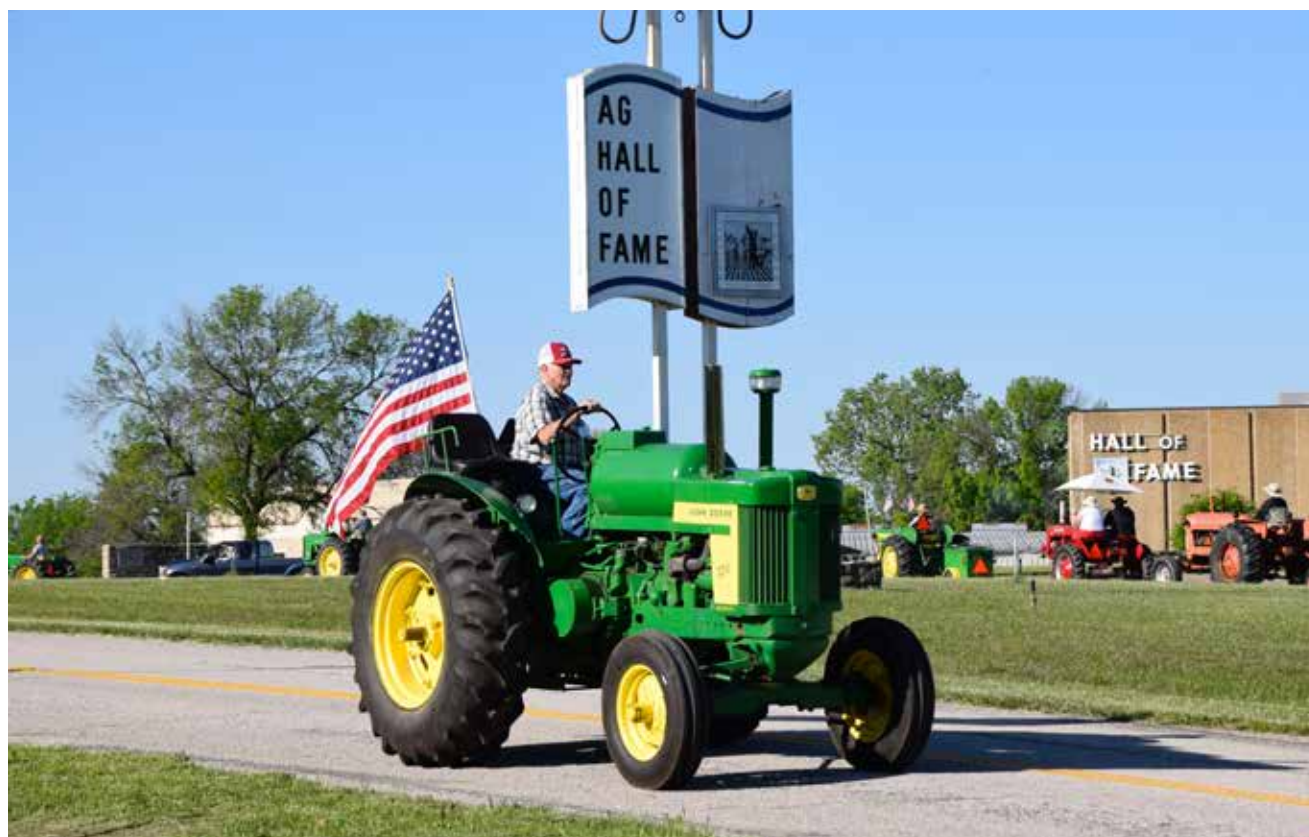
2017 AG HALL TRACTOR CRUISE, WYANDOTTE COUNTY KS