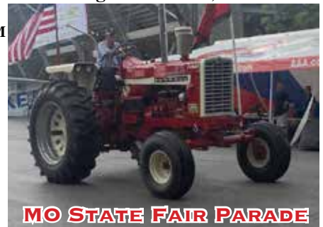
MO STATE FAIR PARADE