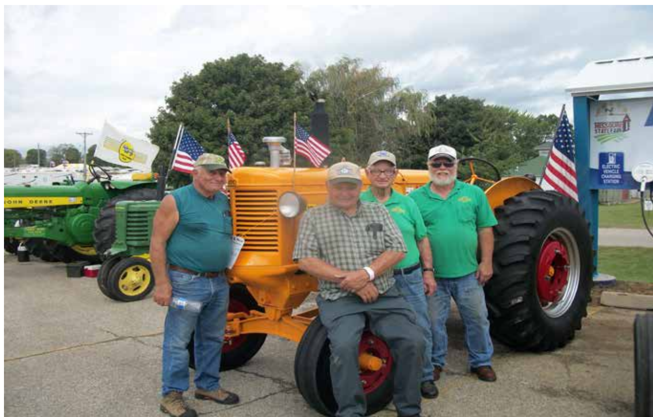
2017 MISSOURI STATE FAIR TRACTOR SHOW AND PARADE