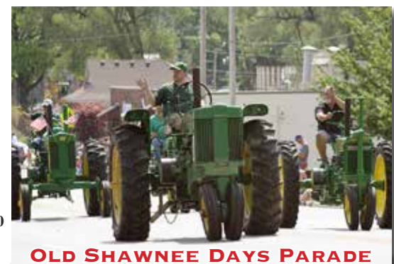
OLD SHAWNEE DAYS PARADE

Note: All dates are subject to change. Please check with a contact person to confirm date.