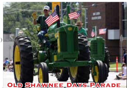
OLD SHAWNEE DAYS PARADE