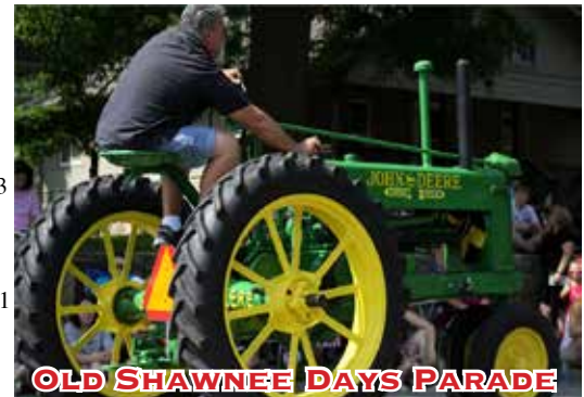
OLD SHAWNEE DAYS PARADE