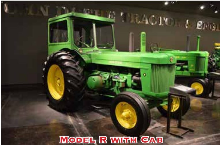
MODEL R WITH CAB

The John Deere Model R was the first with an optional all steel cab. The model R was also John Deere's first diesel tractor and was the first John Deere tractor with a live PTO, which used a separate clutch. During production of the R in, 1949 to 1954, John Deere built 21,293 Model Rs, which sold for about $3,700 apiece. The R specs were as follows: Shipping weight: 7400 pounds, Engine size: 5.75 bore x 8.00 stroke (inches) = 416 CID, Power: 48.58 Belt Horsepower (tested), and 34.45 Horsepower at drawbar (tested).