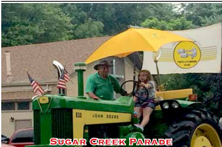
SUGAR CREEK PARADE