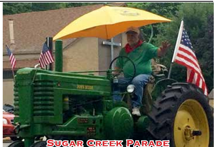
SUGAR CREEK PARADE

John Deere Lawn, Garden, Toys, and Parts