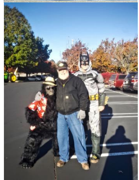
Independence, MO—Halloween Parade