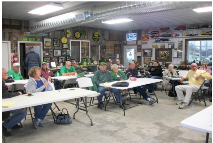
November Meeting—G.A. Salmon Farm