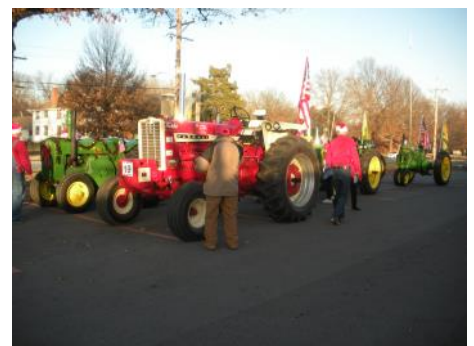
Oak Grove, MO—Christmas Parade