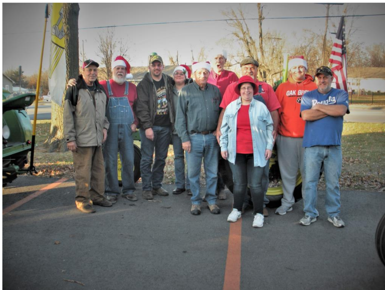
OAK GROVE CHRISTMAS PARADE 2017