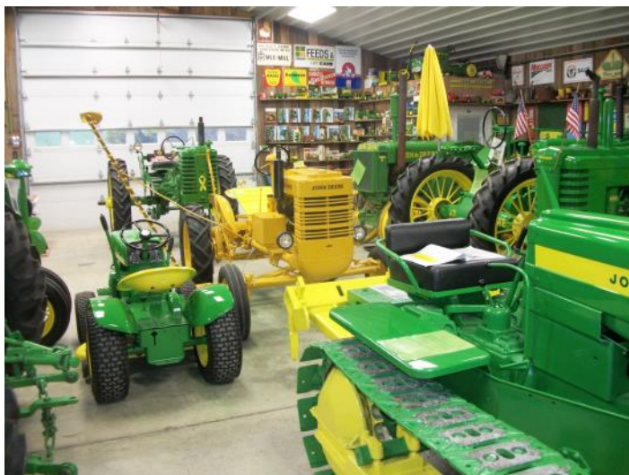
November Meeting—G.A. Salmon Farm

Click here for Back Issues, Little Green magazine, & Classic Farm and Tractor magazine.