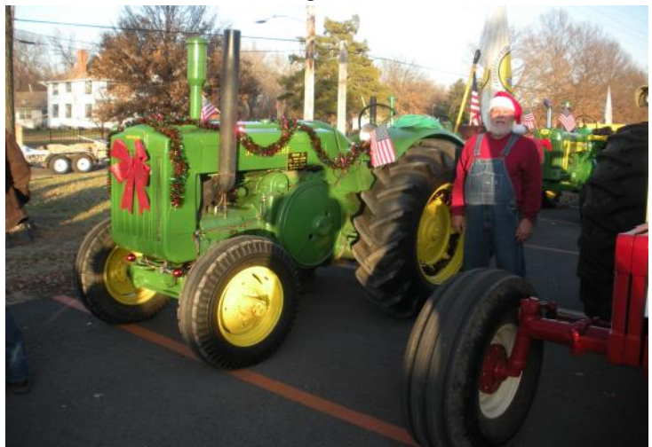
Oak Grove, MO—Christmas Parade