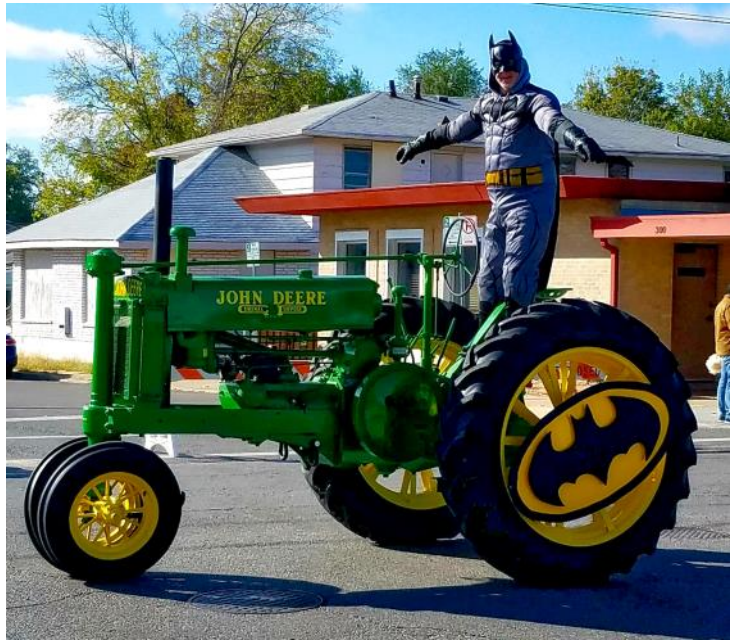
Independence, MO—Halloween Parade