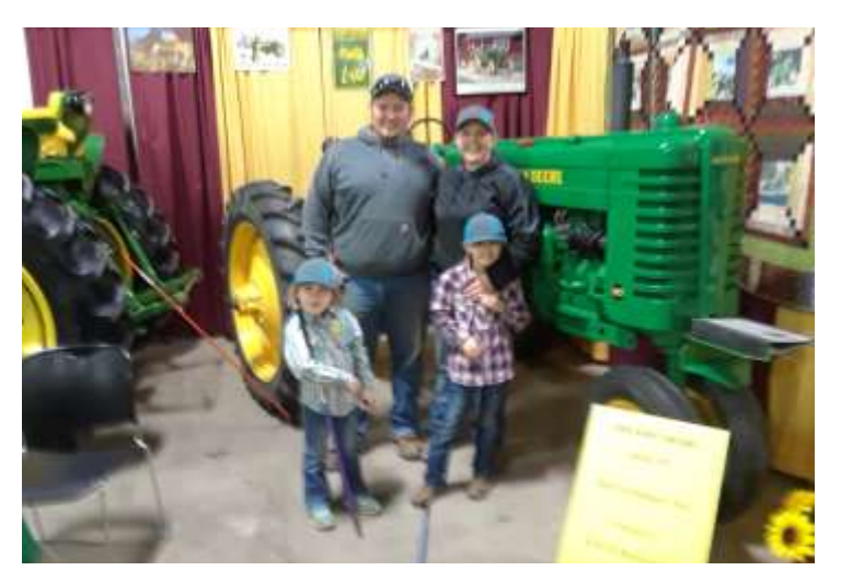
Western Farm Show—KCMO