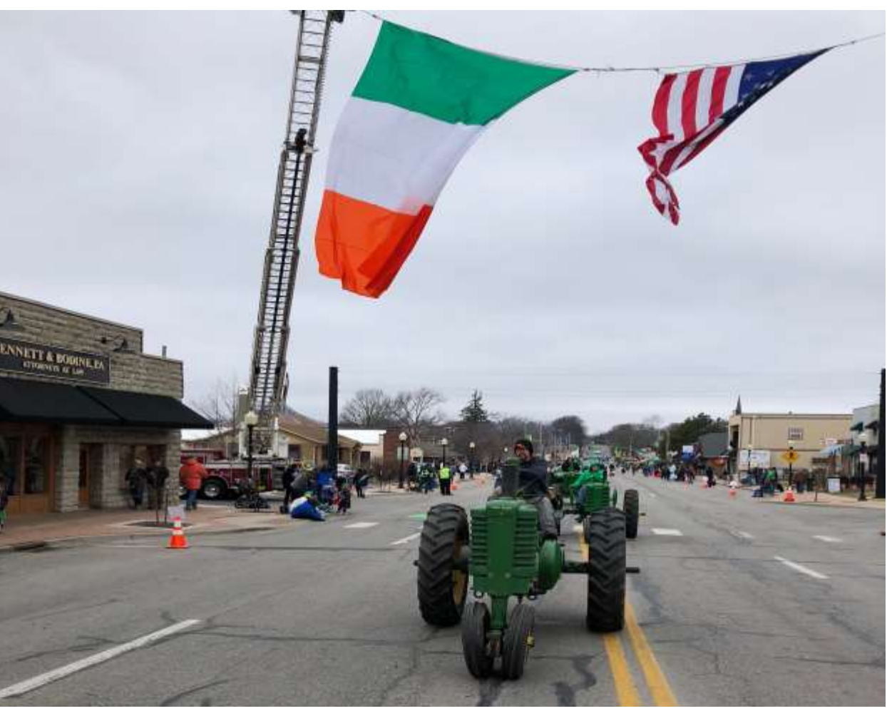
SHAWNEE ST PATRICK'S DAY PARADE 2018