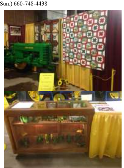
2018 Western Farm Show