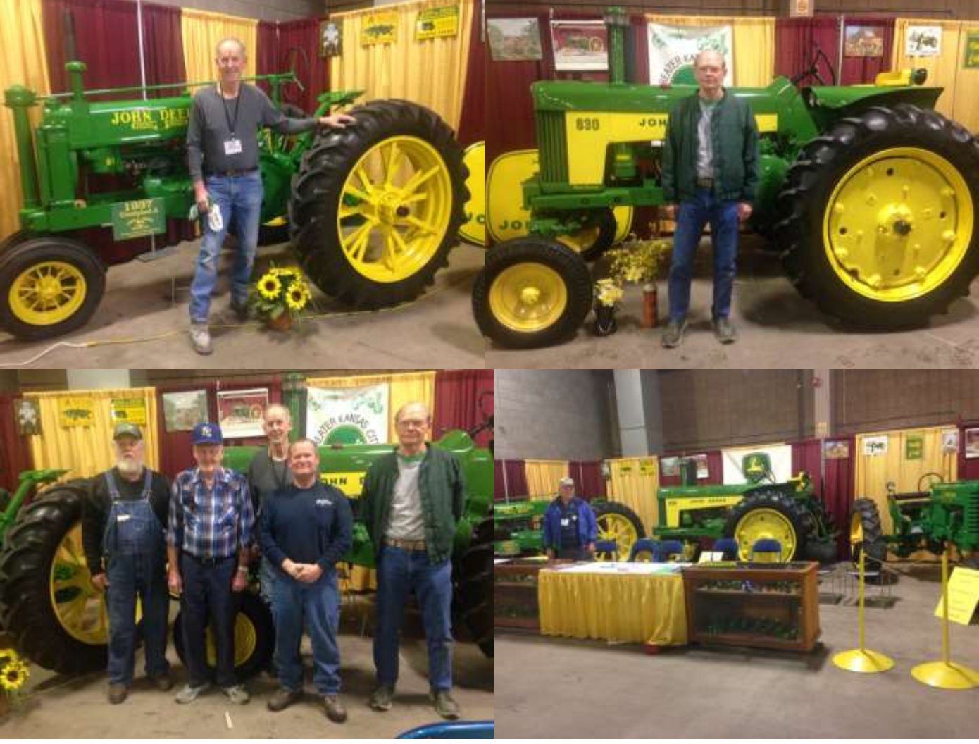
2018 Western Farm Show