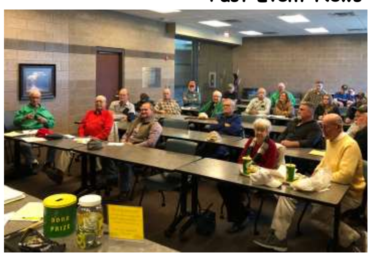
February Meeting—KCMO PD