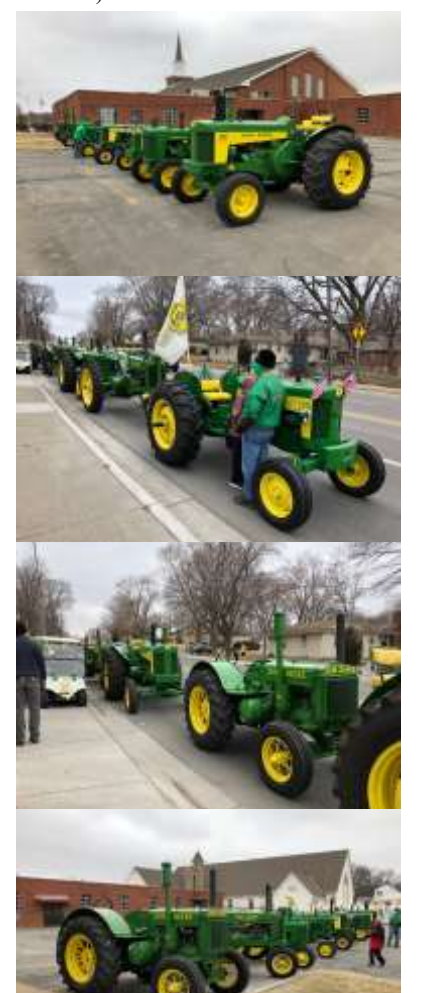
Shawnee, KS-St Pat's Day Parade

Note: All dates are subject to change. Please check with a contact person to confirm date.