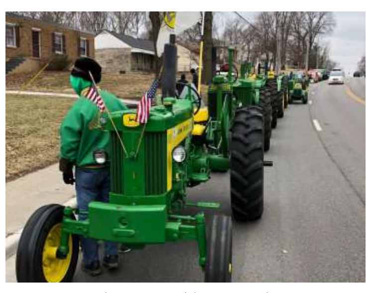
Shawnee St Patrick's Day Parade