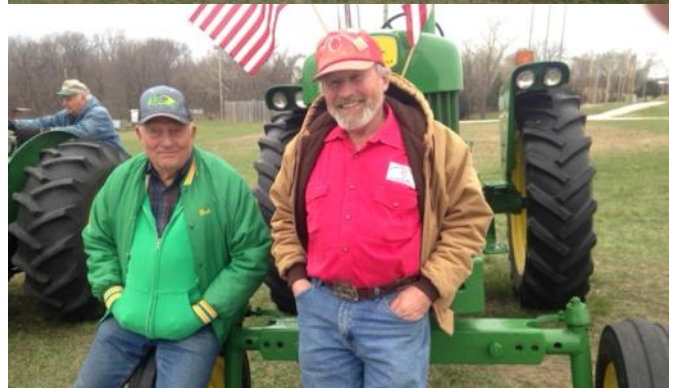
Barn Yard Babies – Ag Hall of Fame