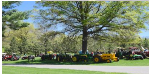
Ag Hall Tractor Cruise