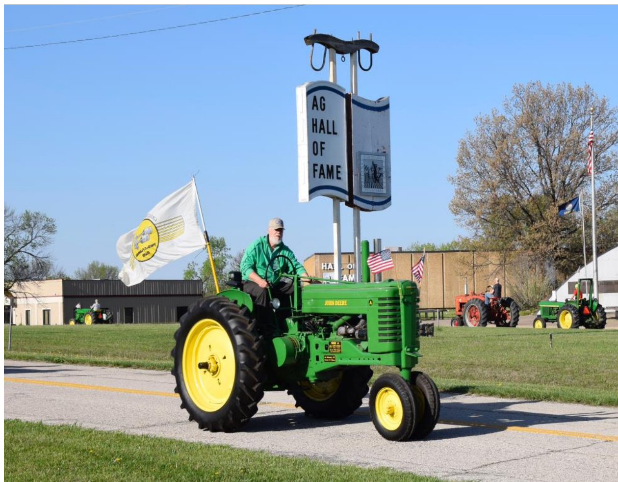
2018 AG HALL TRACTOR CRUISE