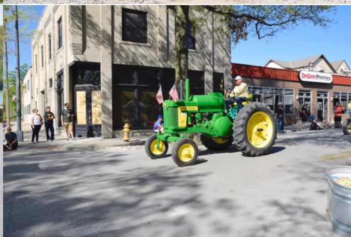
2018 Ag Hall Tractor Cruise