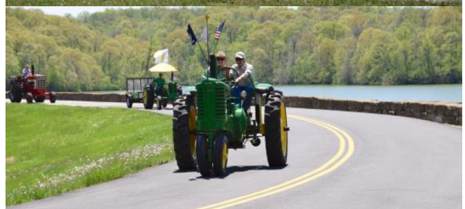
Ag Hall Tractor Cruise