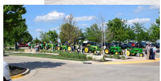
John Deere 100 Years of Tractors—Olathe , KS