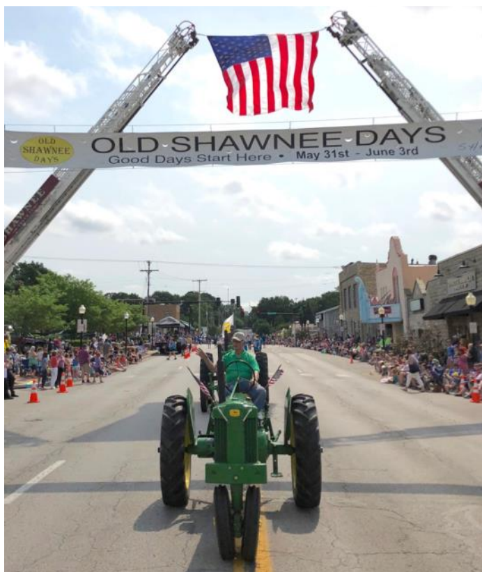
2018 Old Shawnee Days Parade