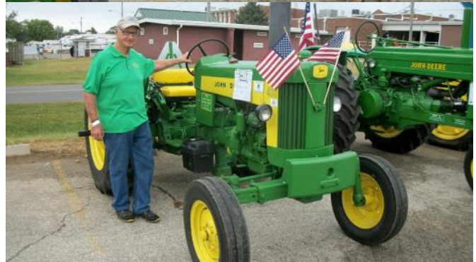
2018 Missouri State Fair Parade