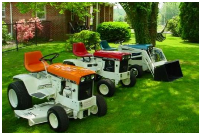
John Deere Patio Tractors

Trivia Answer: During the 1969 model year, John Deere introduced the Custom Color series of lawn and garden tractors and attachments. Collectors often referred to these models as “Patio Tractors”. In 1969, the models offered in Custom Colors were the 110, 112, and 140. The Model 120 was added to this list the following year in 1970. The marketing group at John Deere Horicon Works felt that not all of their customers wanted a green garden tractor, and so by offering a variety of colors, sales of lawn tractors would increase. These Custom Color lawn and garden tractors were painted in Dogwood White except for the hood and seat. The hood and seat were offered in one of four colors: Patio Red, Sunset Orange, April Yellow, and Spruce Blue. These colors matched those of John Deere’s popular competitors. Tractors were shipped minus the hood and seat; the dealer would then install the colored hood and seat of choice. Sales of the Patio Tractors were disappointing and after 1971 production ceased .