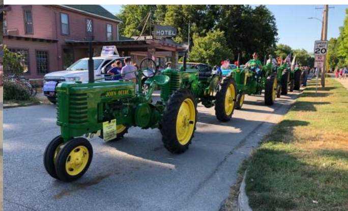
2018 Leavenworth County Fair Parade — Tonganoxie, KS