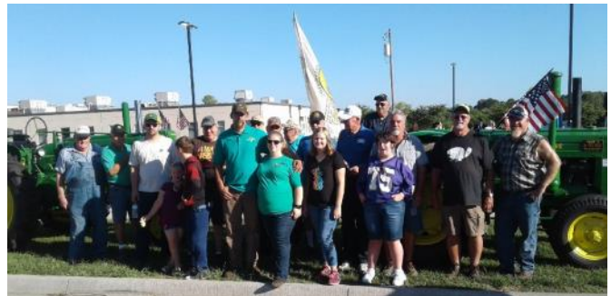
2018 Blue Springs Fall Festival Parade