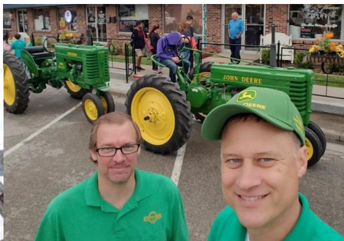
2018 Johnson County Old Settlers Parade — Olathe, KS