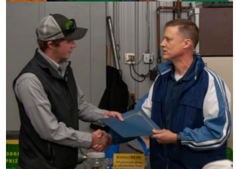
November Meeting—Scholarship Awardees