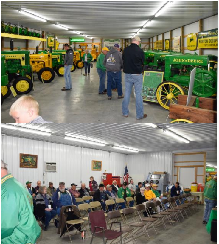
November Meeting—Read Farm