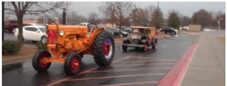
Oak Grove, MO—Christmas Parade