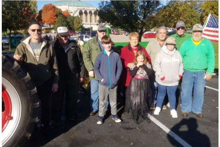
Independence, MO—Halloween Parade

More Details: There were a lot more events in the past few months. Please check out www.GKCTCC.com