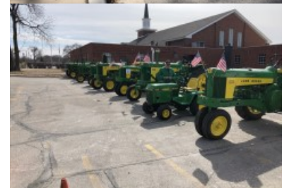
Shawnee, KS—St Pat's Day Parade