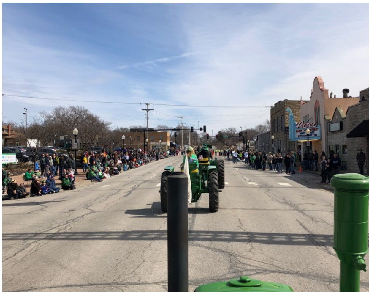
SHAWNEE ST PATRICK'S DAY PARADE 2019