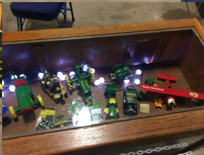
2019 Western Farm Show