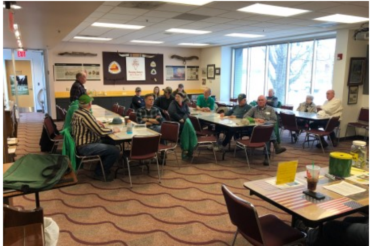
February Meeting—Trailside Center