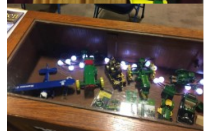
2019 Western Farm Show

Note: All dates are subject to change. Please check with a contact person to confirm. 7