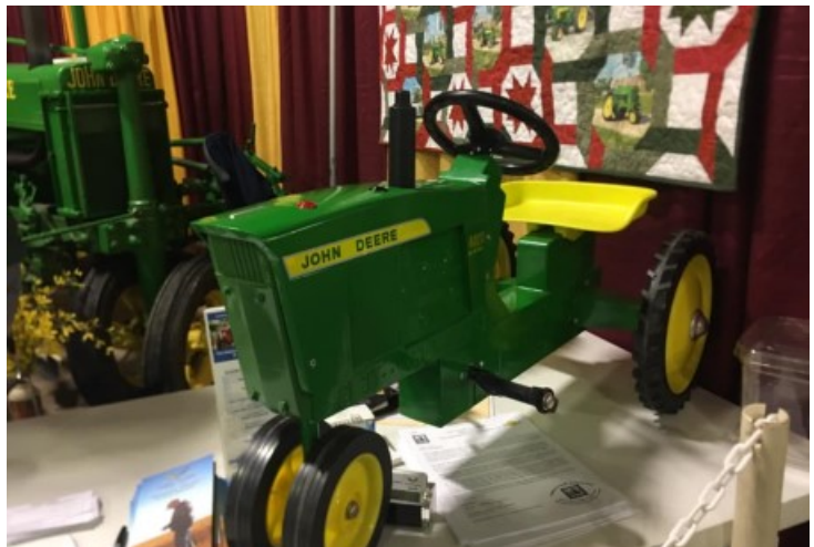
Western Farm Show—KCMO