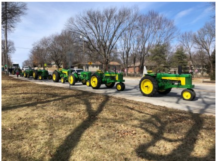
Shawnee St Patrick's Day Parade