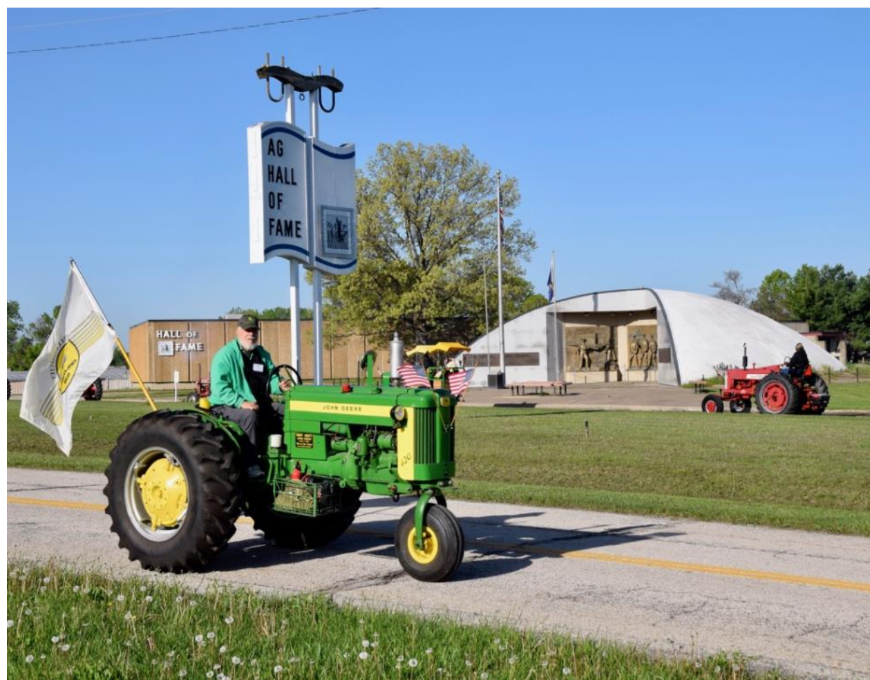
2019 AG HALL TRACTOR CRUISE