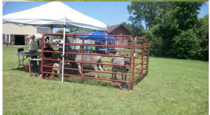
Barn Yard Babies – Ag Hall of Fame