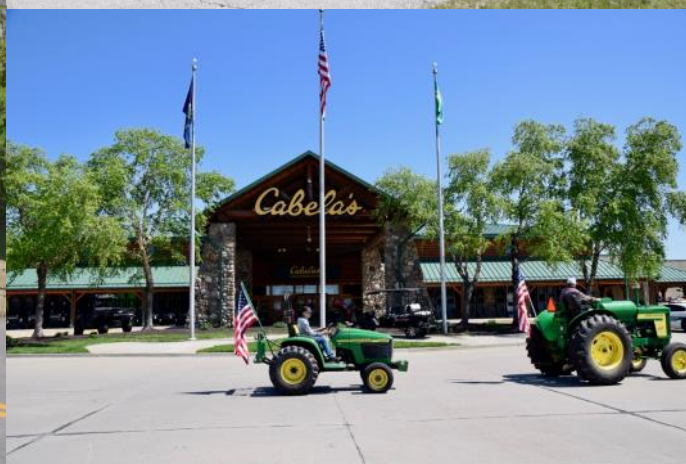
2019 Ag Hall Tractor Cruise