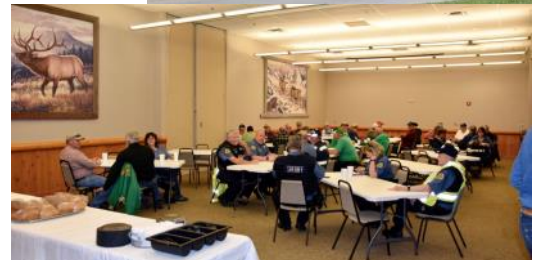
2019 Ag Hall Tractor Cruise