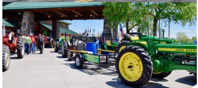
2019 Ag Hall Tractor Cruise