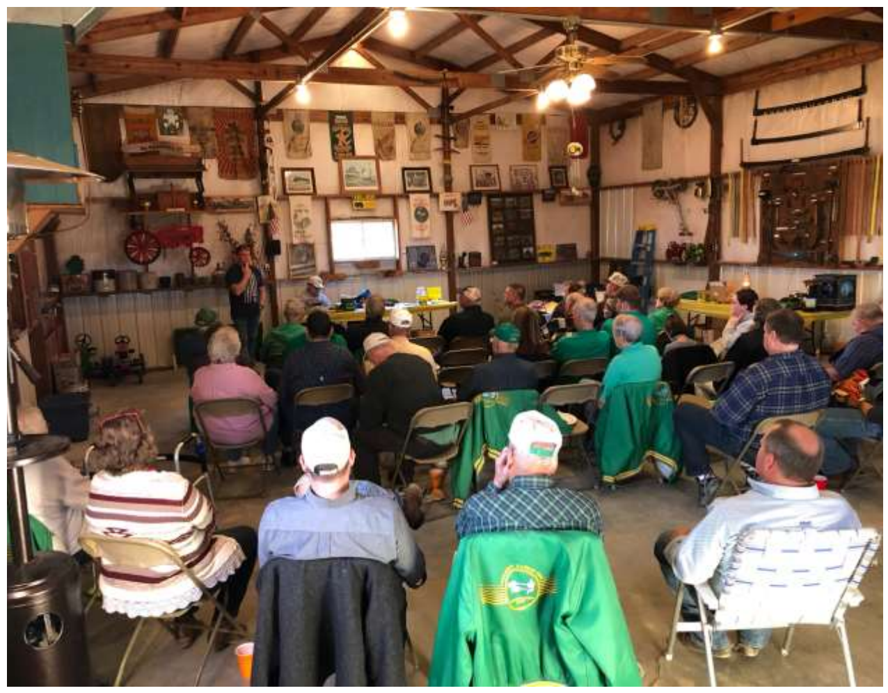
November Meeting and White Elephant Auction