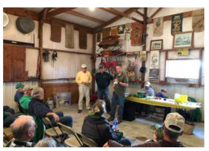
November GKCTCC Meeting