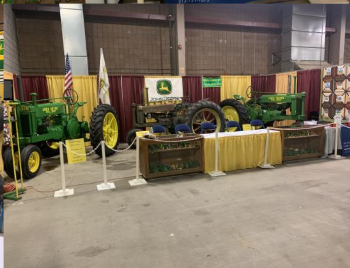
2020 Western Farm Show