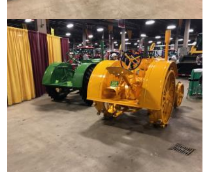
Jack's Tractors - Western Farm Show