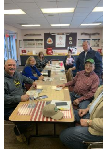
February Meeting—Trailside Center