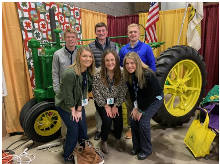
2020 Western Farm Show—KCMO (FFA Students)