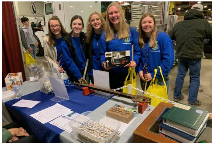
2020 Western Farm Show—KCMO (FFA Students)