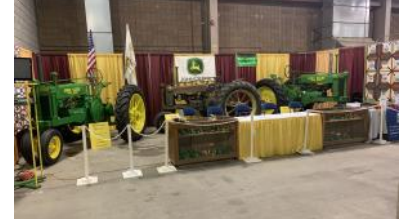
2020 Western Farm Show