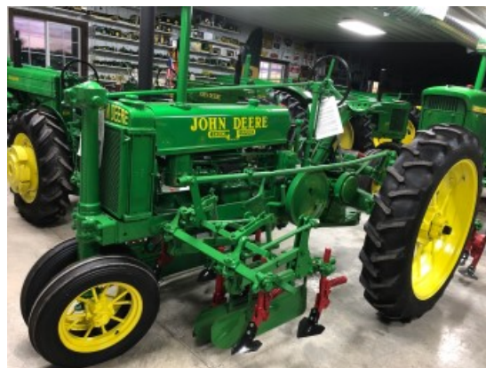
Grandpa's JD1936B before and after restoration