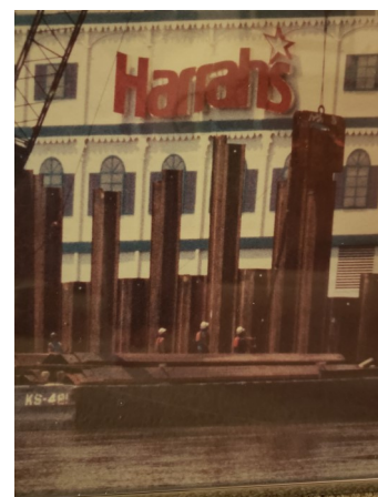
Pilings creating "bathtub" for casino riverboat 1993