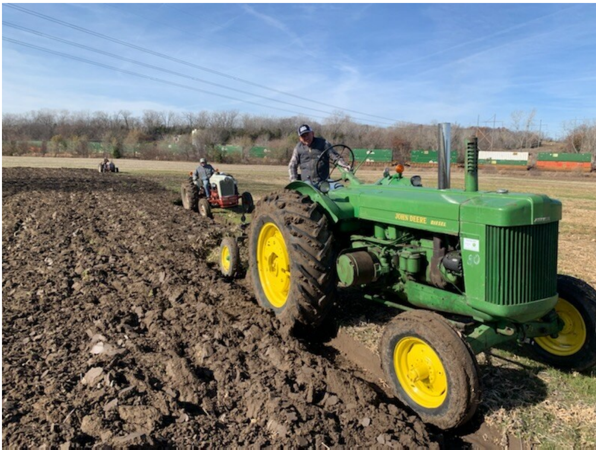
November 22, 2021 FALL PLOW DAY Bonner Springs, KS