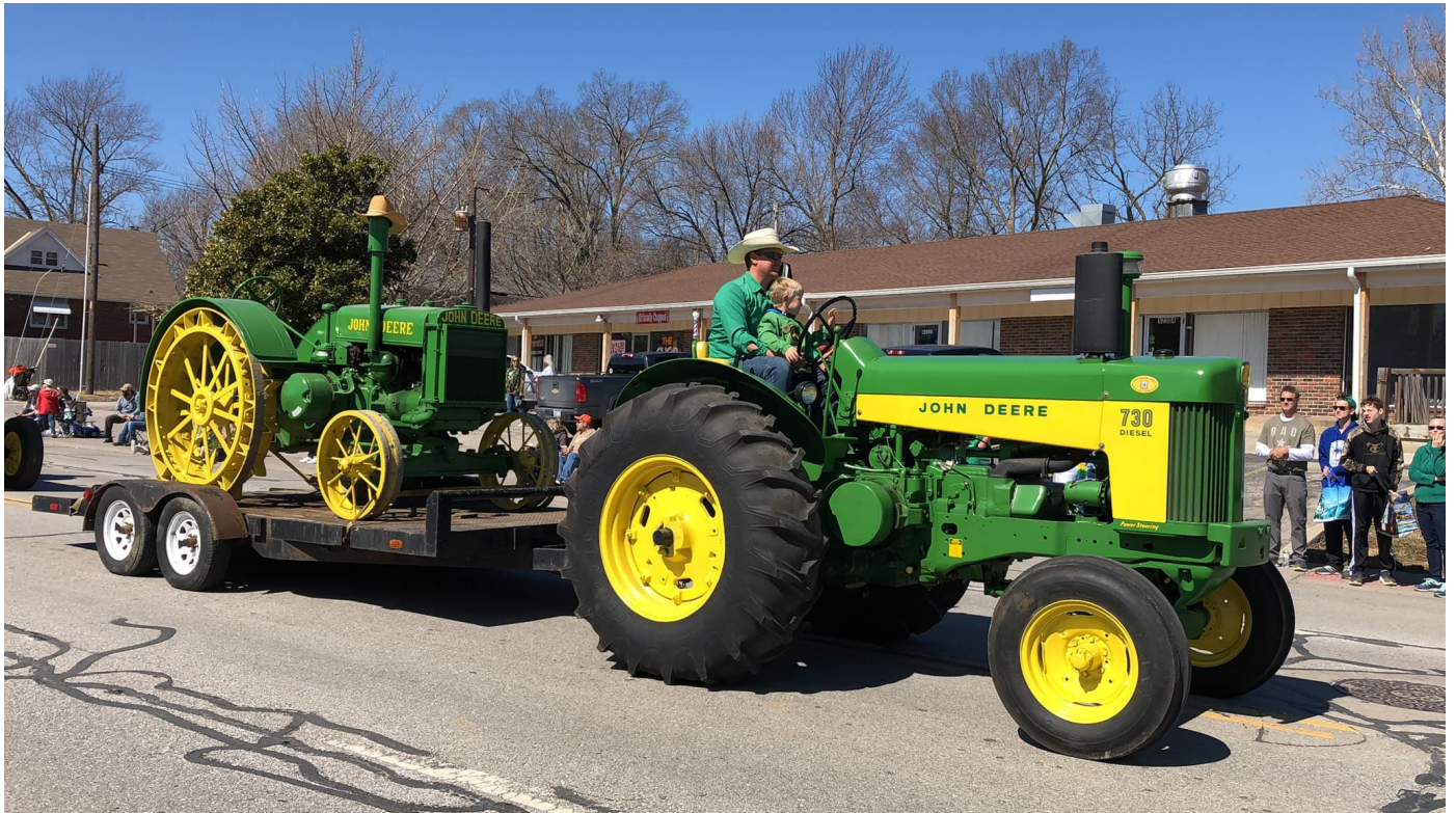
St Patrick's Day Parade, Shawnee, KS March 13, 2022