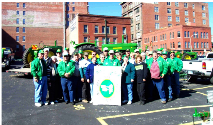
Throwback Picture: 2004 American Royal Parade

As I am writing this, we just finished our first Board Meeting of 2024. We have a lot of great activities planned for this year and I look forward to being here to see everyone through the year. The Directors hope to see everyone at the February 4th meeting at the American Truck Historical Museum.