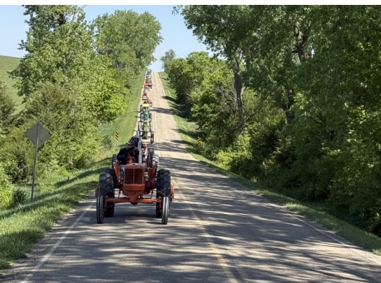
2026 Ag Hall Tractor Cruise in rural LV county.