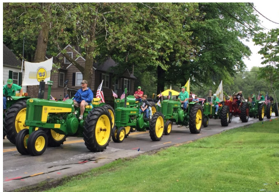
Throwback picture of the 2015 Shawnee Parade.