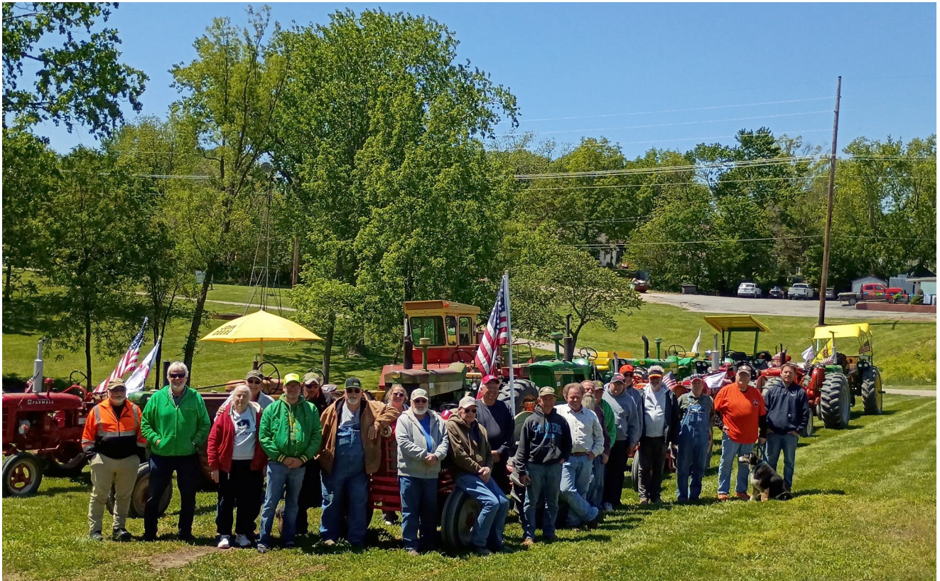
TRACTOR CRUISE 2026